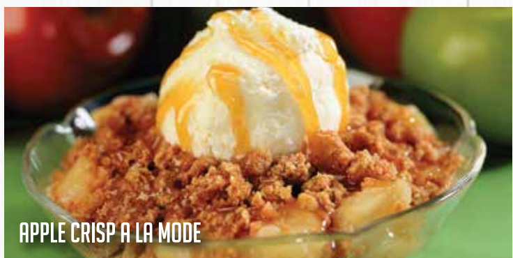
APPLE CRISP A LA MODE