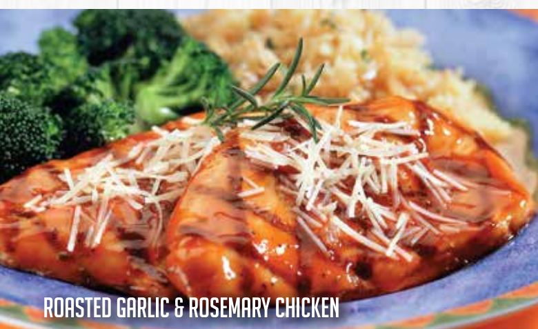
ROASTED GARLIC & ROSEMARY CHICKEN

Two seasoned chicken breasts, grilled and topped with fire roasted red pepper sauce. Served with loaded mashed potatoes and mixed vegetables