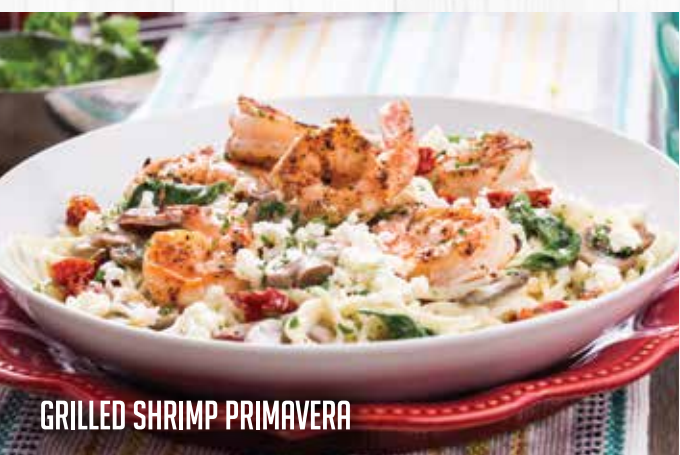
GRILLED SHRIMP PRIMAVERA

Juicy salmon perfectly seasoned in a rich creamy sauce and tossed with fettuccine