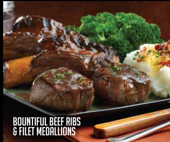
BOUNTIFUL BEEF RIBS & FILET MEDALLIONS