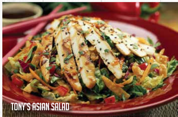
TONY'S ASIAN SALAD