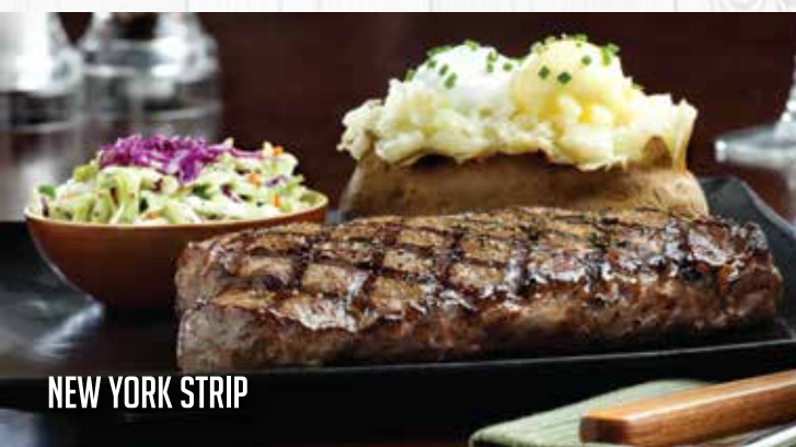
NEW YORK STRIP

A heartier, leaner cut of beef with its own distinctive taste. Seasoned to perfection with Tony's special seasoning. Served with your choice of two sides