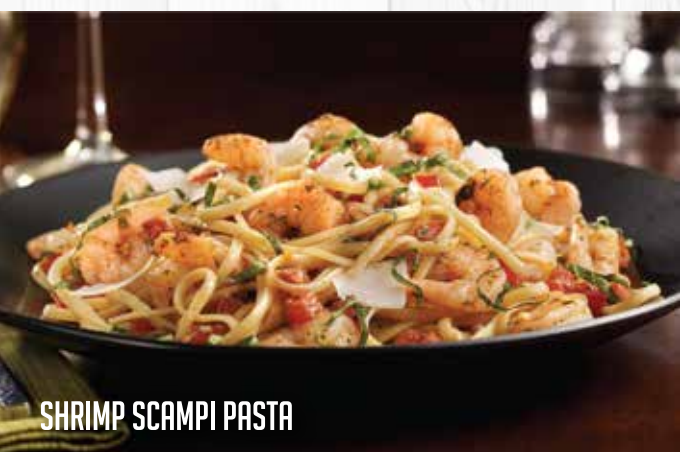
SHRIMP SCAMPI PASTA

Beef tenderloin tossed with seasoned vegetables and mushrooms in a juicy roasted marinara sauce and topped with Romano cheese and basil chiffonade