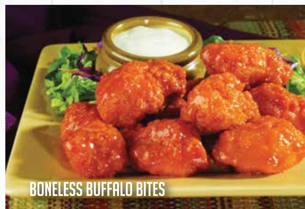
BONELESS BUFFALO BITES

Tender rings of calamari coated in a crunchy breading, deep-fried and served with garlic aioli sauce