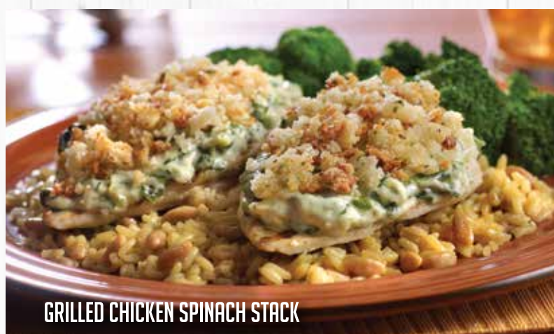
GRILLED CHICKEN SPINACH STACK

Add-ons: Healthy and Delicious Side SALAD 15