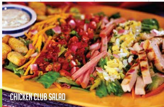
CHICKEN CLUB SALAD

*Allergen Notice: If you have an allergy or sensitivity, please let our servers know.