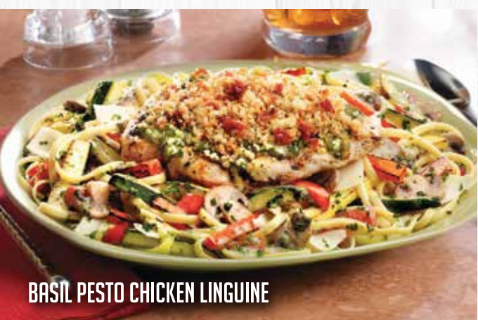
BASIL PESTO CHICKEN LINGUINE

Linguine tossed with grilled shrimp, spinach, sun-dried tomatoes, mushrooms and feta cheese in a creamy chive butter sauce