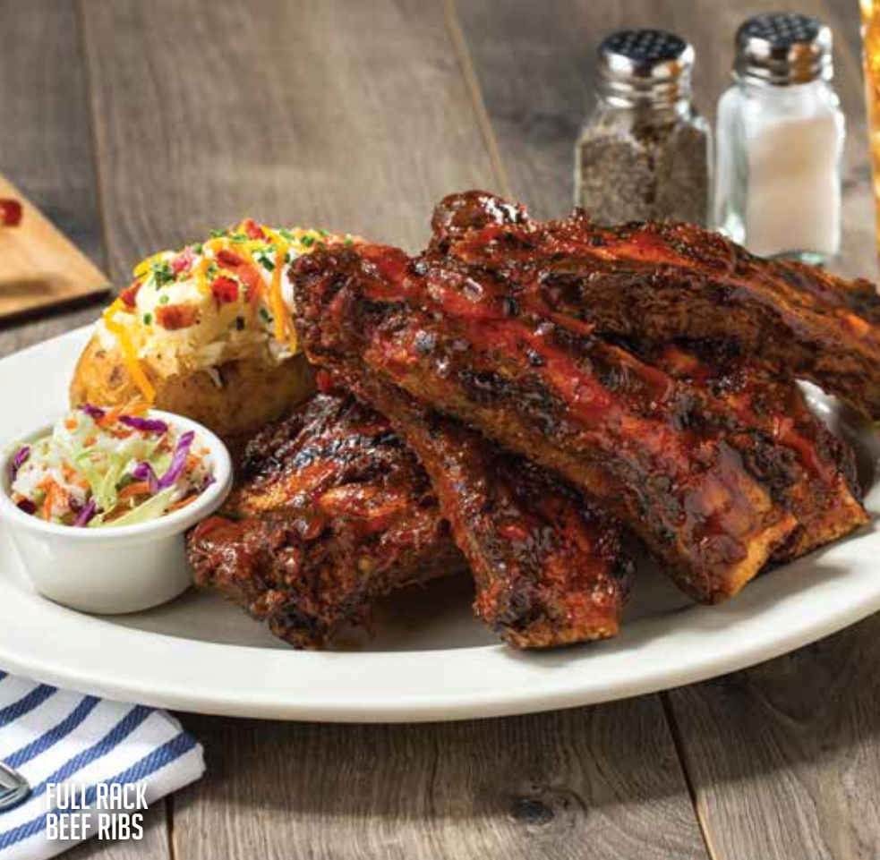
FULL RACK BEEF RIBS