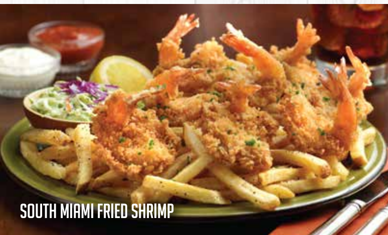
SOUTH MIAMI FRIED SHRIMP