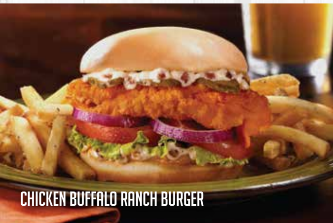
CHICKEN BUFFALO RANCH BURGER

A fire grilled chicken breast topped with italian cheese, lettuce, fresh diced tomatoes and our special garlic ranch