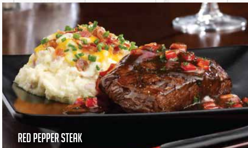
RED PEPPER STEAK