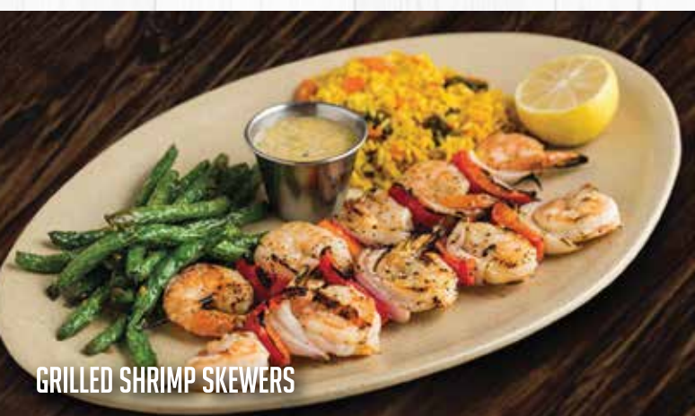
GRILLED SHRIMP SKEWERS