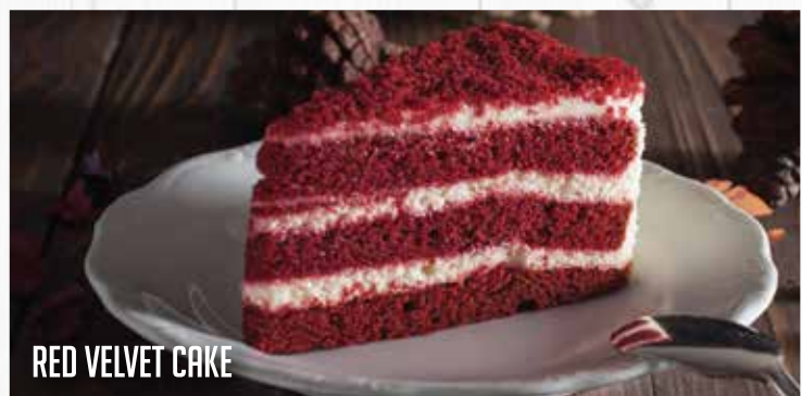
RED VELVET CAKE

Enjoy a half portion of Chocolate Brownie Sundae plus a half portion of Apple Crisp