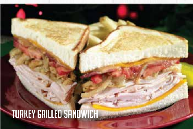
TURKEY GRILLED SANDWICH

We only serve PREMIUM BEEF PATTIES , freshly hand-made everyday! All handhelds are served with French fries