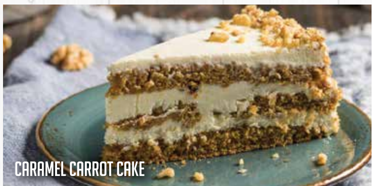
CARAMEL CARROT CAKE